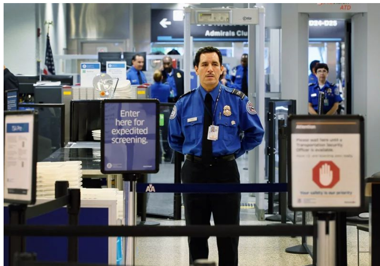
“A TSA agent waits for passengers to use the TSA PreCheck lane being implemented by the Transportation Security Administration at Miami International Airport on October 4, 2011 in Miami, Florida” (Alter, 2014).

Everyday Public Administration: Transportation Security Administration